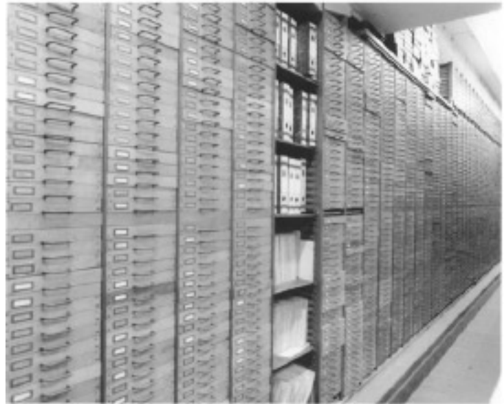
The Monotype archive (above) before its move in 1996 to the Type Museum consisted of “23,000 drawers of every type design and size in every world language: 860,000 letter patterns and ‘display’ punches; 1.5 million ‘composition’ punches and 3.5 million brass matrices.” Weighing hundreds of tons—the equivalent of many elephants—the Museum designed the elephant at top as its first emblem.

The Museum has moved aggressively to build its collection beyond this Monotype nucleus. In 1996, the Museum purchased the archive and plant of Stephenson Blake & Co., Ltd, of Sheffield, a “cold metal” foundry (which by 1937 had acquired 18 London foundries), and in the same year the wood-letter plant of Robert DeLittle of York, the largest maker of woodtype in the British Isles. However, all this growth and the vital task of renovating the buildings has hobbled the Museum’s ability to accommodate visitors. The Monotype pantographs and matrix making machines have been set up for fulfilling the few orders, but as of my July 2002 visit, most patterns and punches were still neatly stacked in pallets. They are not yet usually available for reference. Once the